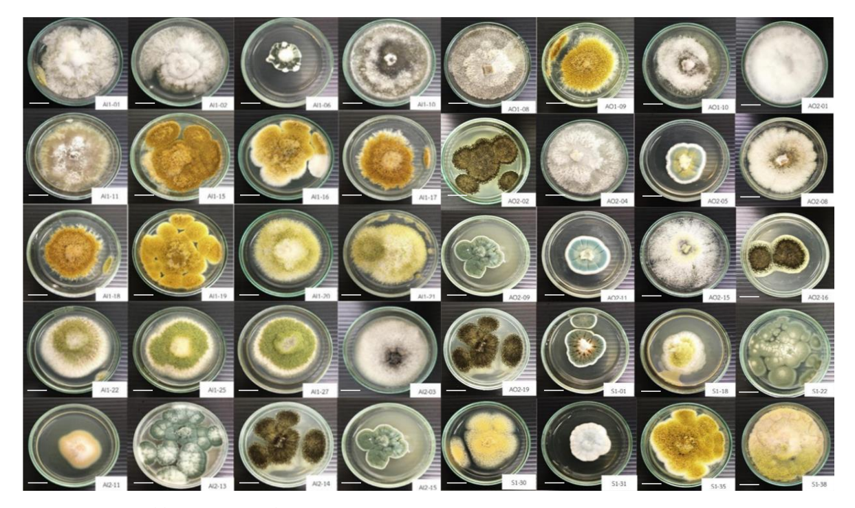
Fig. 2 Examples of fungal diversity found in soil and air samples. Scale bar = 1 cm.

and public health risks to workers and animals in poultry houses. Two poultry farms selected for the present study were investigated for the incidence of fungal contamination in farm sites. The fungal community was investigated from soil and air samples and analyzed for seasonal variations to evaluate the extent and presence of fungi in each season. Prior to the study on fungal contamination in these habitats, characteristics of the poultry farms and surrounding environment were observed. Likewise, the biosecurity level of the farms was evaluated to assess the vulnerability of the farms to fungal and other microbial diseases.