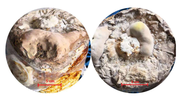
Fig. 4 Primordium formation in Ganoderma gibbosum under artificial cultivation.

to G. gibbosum , with 99% homology. Combined with the observed morphological characteristics, the isolated SS was identified as G. gibbosum .