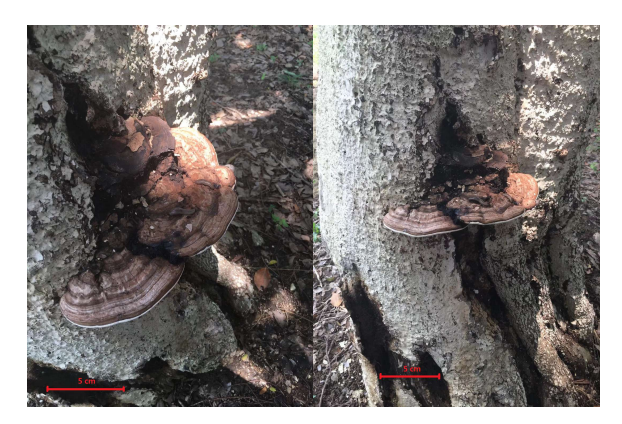
Fig. 1 Morphology of wild macrofungi.

yet been reported in G. gibbosum as a wild medicinal fungal resource. Chen et al [8] analyzed and compared the amino acid contents of the fruiting bodies of Ganoderma in Fujian province and found that the total amino acid content in G. gibbosum was lower than that in G. applanatum, but the proportion of essential amino acids was much higher; however, the amino acid characteristics and protein quality were not studied. In this study, mycelia, artificially cultivated fruiting bodies and wild fruiting bodies of G. gibbosum were used as the research materials, and their protein quality was analyzed by measuring the crude protein content and amino acid composition. The purpose of this work was to evaluate the nutritional value of the protein of G. gibbosum, thus providing a theoretical reference for further utilization of this fungus.