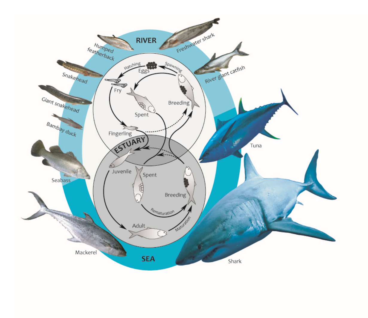
Fig. 3 A schematic representation of hilsa predators in the marine and riverine ecosystems of Bangladesh.

sardine and scad in the dietary compositions of tuna and mackerel from the Malaysian peninsular sea. The wide mouth gape and the presence of jaws with fine and re-curved teeth facilitate Bombay ducks in catching large sized preys including hilsa juveniles<sup>20</sup>. Freshwater shark, river catfish, humped featherback, stripped snakehead and giant snakehead are the dominant predators in freshwater bodies, including the Padma-Meghna river system. These predators mostly prey on small indigenous species of sprat, carplet, barb, minnow, perch, and gourami as well as juveniles of hilsa and carps. Reconciling the above facts, it is logical to illustrate major predators of hilsa in the marine and riverine ecosystems (Fig. 3).