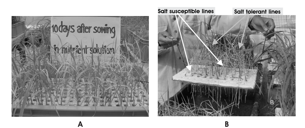
Fig 1. Screening at seedling stage in Yoshida (1976) nutrient solution. A) 10 days after sowing in nutrient solution.

B) rice palnt under severe stress (21 days after salinization). Susceptible lines were given scores of 7-9, moderately tolerant lines 5-6, and tolerant lines 1-4.