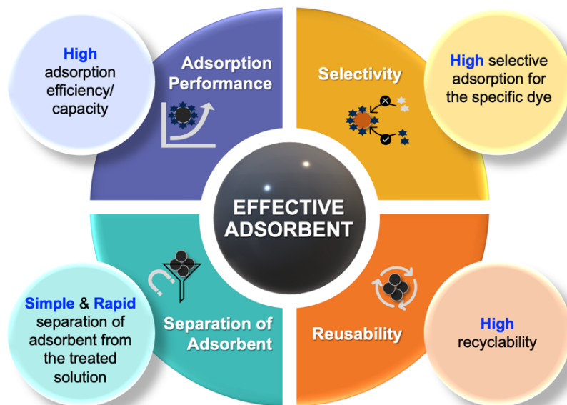
Fig. 1 Typical key characteristics of effective adsorbent.

nanoparticles to enhance the selective adsorption of anionic and cationic dyes.