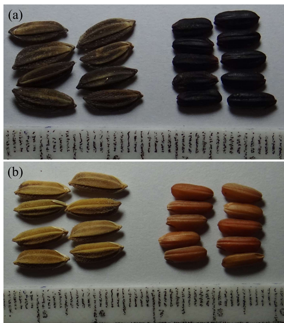
Fig. 1 Grains of O. sativa cultivars Khumthan (a) and Norprae (b).

vars Khumthan and Norprae are found in Chiang Sean district, Chiang Rai province, Thailand. Both cultivars have black and red grains, respectively (Fig. 1). The nutritional composition, antioxidant activity, as well as conservation method, were not investigated before. Hence this study aimed to study O. sativa cultivars Khumthan and Norprae in the aspects of nutritional information, antioxidant activity and callus induction for conservation and further development for valuable metabolites.