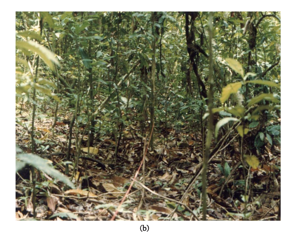
Fig 2. Forest structures at the study area : (a) Primary forest (b) Secondary forest.